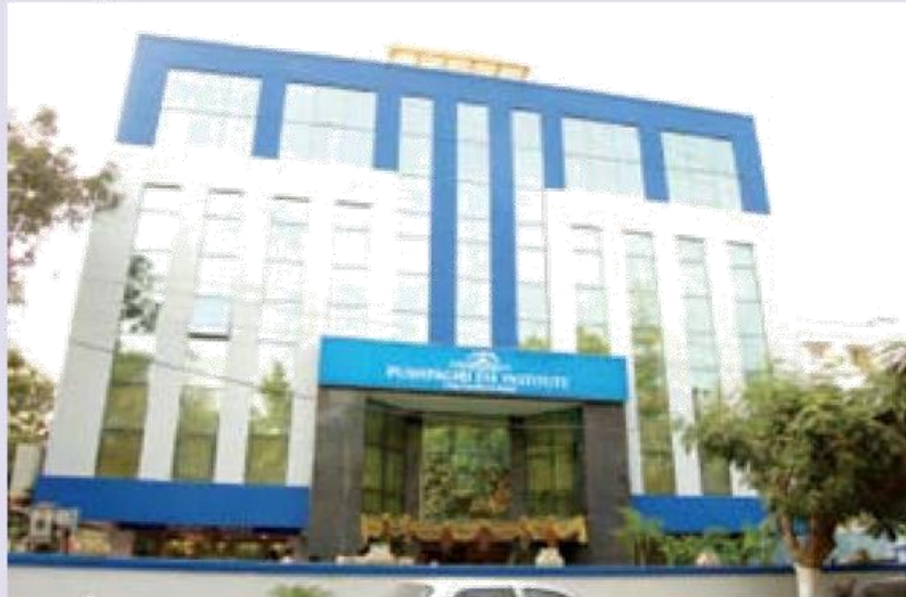
Pushpagiri Eye Institute, Secunderabad