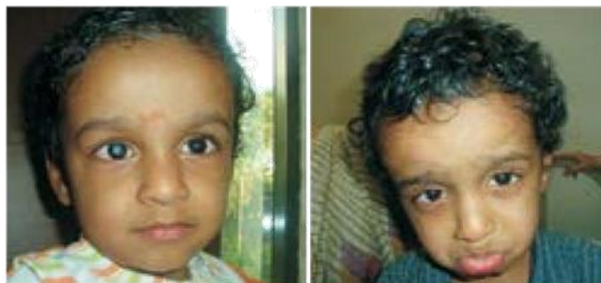
Before Cataract Surgery