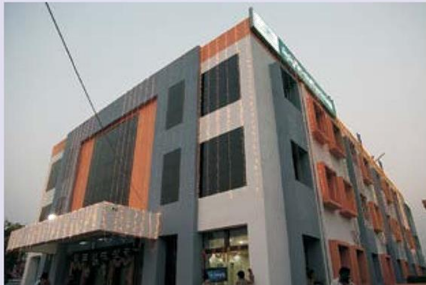
Pushpagiri Eye Hospital, Vizianagaram